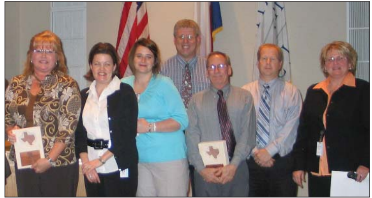
The North Richland Hills Parks & Recreation Department was honored with several state and regional awards in 2009.

Recreation, was inducted into the Grand Prairie Parks & Recreation Hall of Fame.