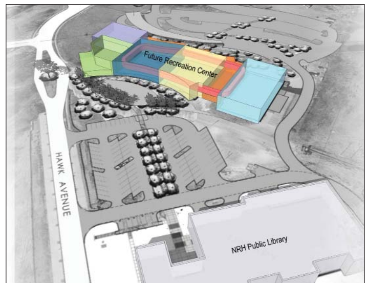
The new recreation center will be located near the North Richland Hills Public Library.

Your new recreation center will create a civic core and an exciting sense of place within our community. Watch for updates on the new recreation center’s progress in future NRH newsletters and on the city’s web site at www.nrhtx.com .