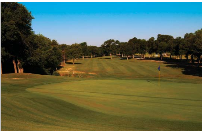
Iron Horse Golf Course celebrated its 20th anniversary in 2009. Improvements were made to the course throughout the year.