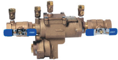
Figure 3: RPZ Backflow Prevention Assembly Example

The table below gives a general overview of common cross connections and backflow prevention methods: