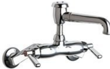
Figure 2: Atmospheric Vacuum Breaker Example